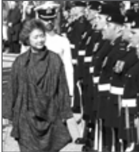
Governor General, the Rt. Hon. Adrienne Clarkson, inspects the honour guard at a ceremony marking the 100th anniversary of the Lord Strathcona's Horse (Royal Canadians). She unveiled a statue of the first Lord Strathcona on the south grounds of the Legislature Building.