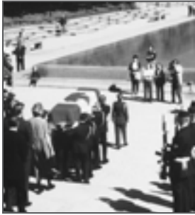
The coffin of former Member and former Lieutenant Governor, the Hon. J.W. Grant MacEwan is escorted from the Legislature Building following an official Lying-in-State.